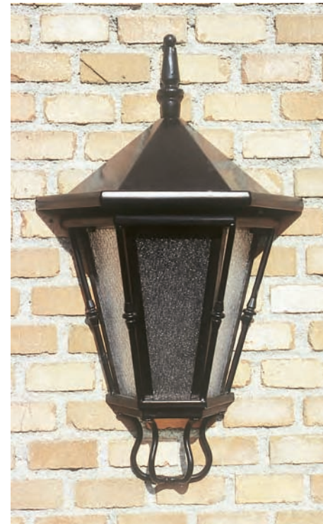
Románico luminaire for wall fix

For other colours, please indicated RAL reference